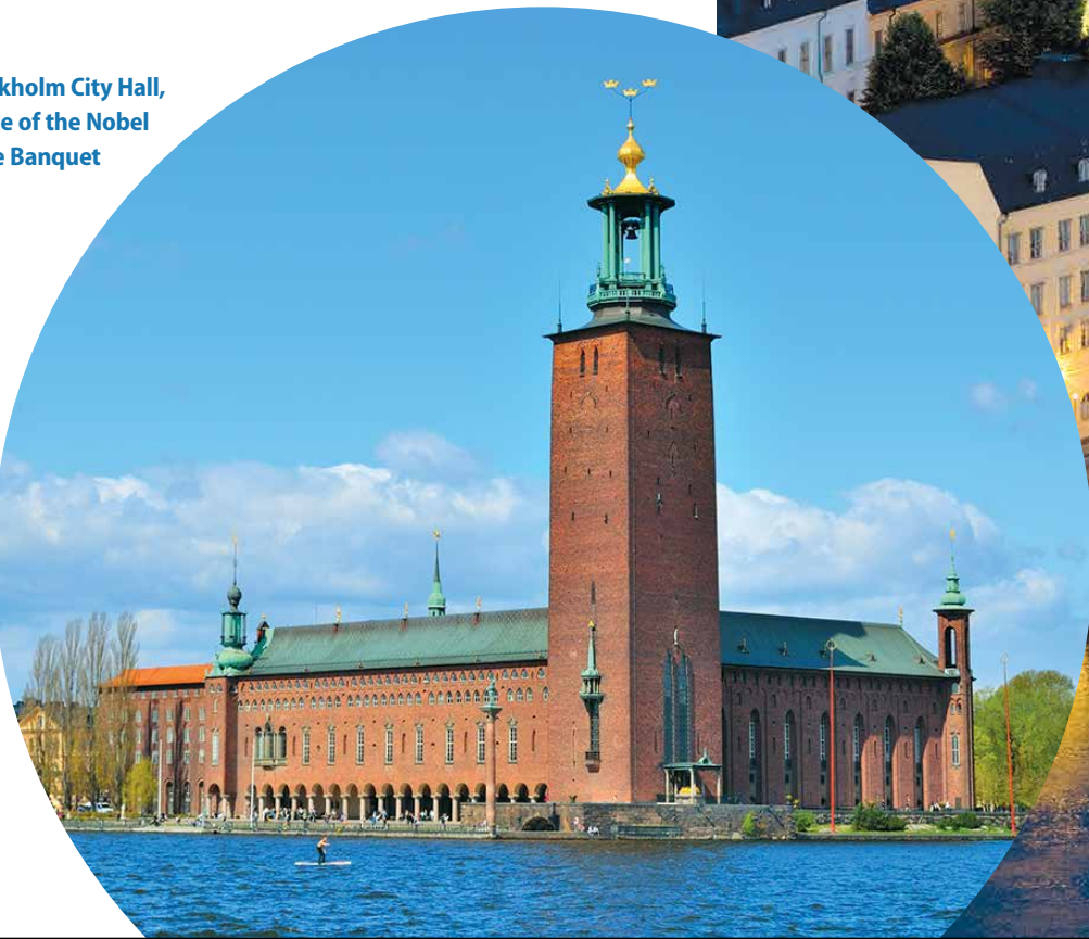
Stockholm City Hall, home of the Nobel Prize Banquet

We believe that a successful study abroad experience involves pushing yourself to discover different ways of thinking and living. Integrating within your new host country is not an easy task—especially in a four-month academic semester—so we work hard to create opportunities to meet Swedes and experience Swedish culture. We hope you'll join us for this unique intellectual and personal challenge.